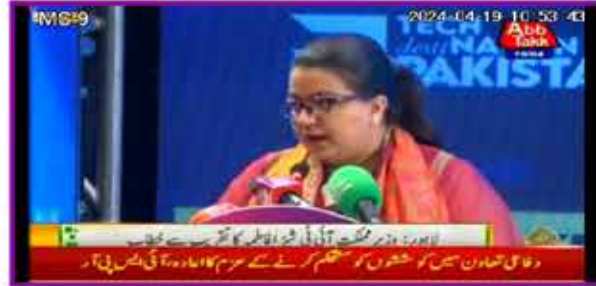
Aab Takk News Live