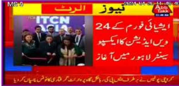
Abb Takk News