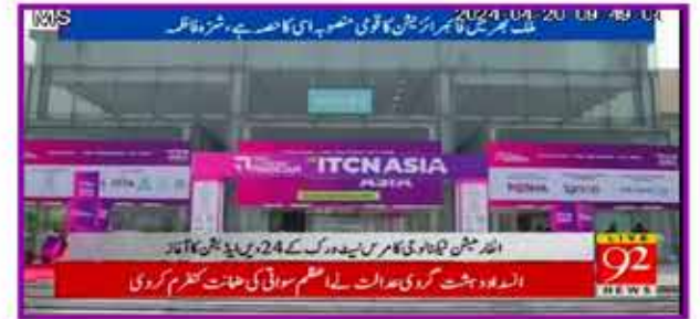
92 News HD