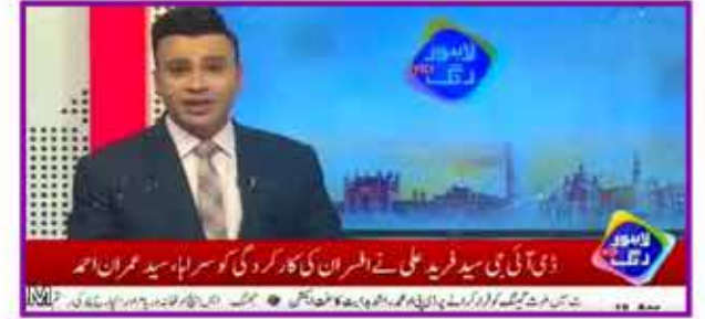
Lahore Rang HD