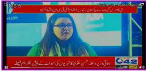
City42 News Live