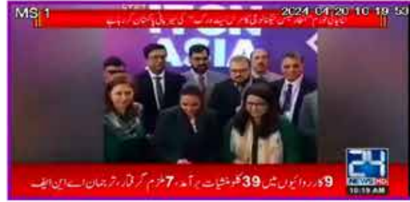
24 HD News