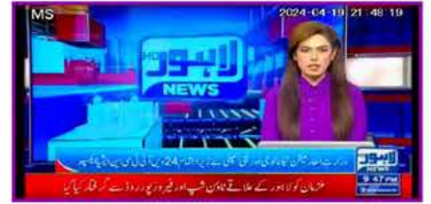
Lahore News HD