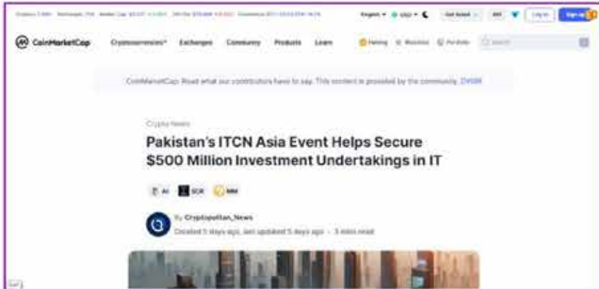
Coin Market Cap