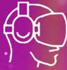
AR / VR