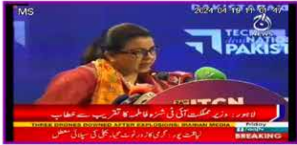
Aaj News Live