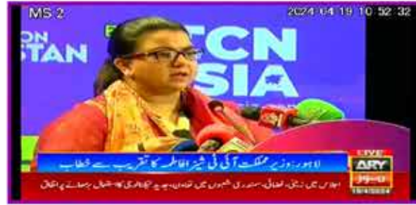
ARY News Live