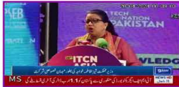
Suno News HD