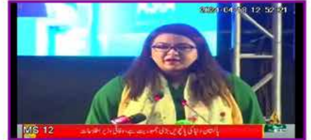
PTV News Live